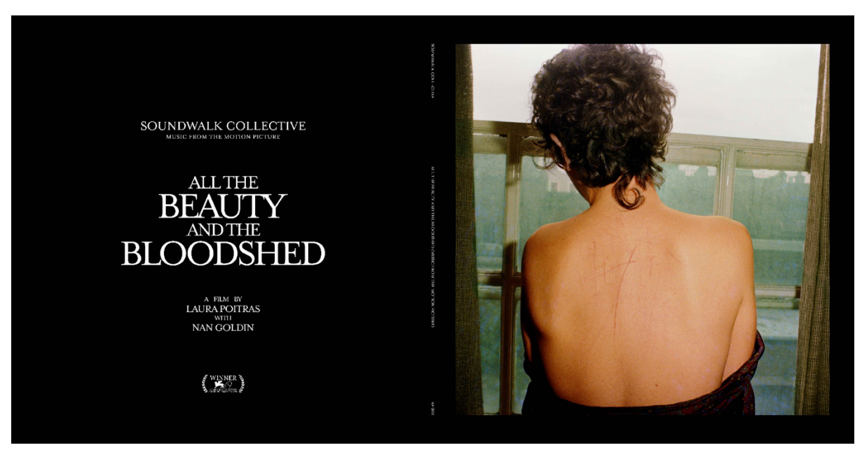
\textbf{Back cover photo by Nan Goldin: 'Self-Portrait with Scratched Back After Sex, London, 1978' / Download high-res \underline{here} } \\

For more information, contact billy@9pr.co.uk.